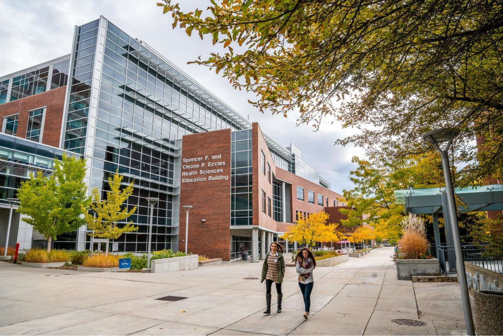
Spencer F. and Cleone P. Eccles Health Sciences Education Building

Through a grant from the National Institutes of Health, the U's College of Health is studying if utilizing Virtual Reality devices can improve outcomes for stroke patients .